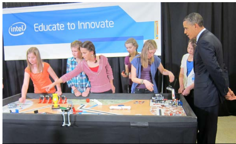
President Barack Obama learns about FLL at Intel with Oregon's FLL BindleBots team in February 2011.

Intel Oregon FIRST ® LEGO® League Championship Liberty High School – Hillsboro – January 14, 2012 Liberty High School – Hillsboro – January 15, 2012